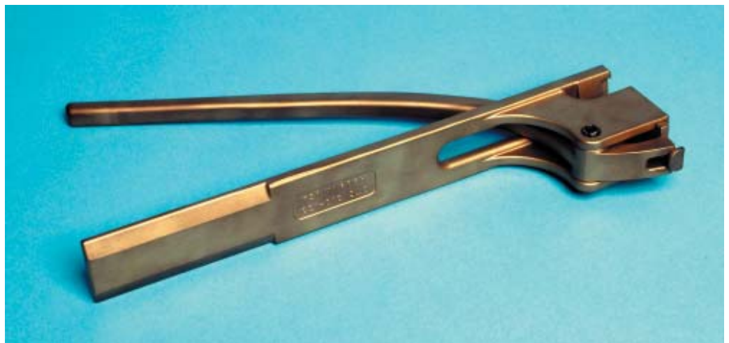
Investment cast fuel removal tool manufactured by Aristo Cast showcases investment casting alloy choice and quick turnaround.

The investment cast fuel removal tool saved the auto manufacturers the cost of completely replacing the fuel tank.