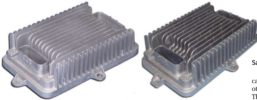
This voltage regulator (r) designed by Sure Power Industries was rubber plaster mold cast (l) by A.L. Johnson prior to high-production diecasting. The plaster models allowed engineers to examine design efficiency and casting soundness.

verse pattern machined from aluminum. An inverse-patterned rubber mold then is cast against the epoxy mold, and this rubber mold is used to cast plaster into a new mold. Once the plaster solidifies, the plaster mold is cut out and ready to cast with metal.